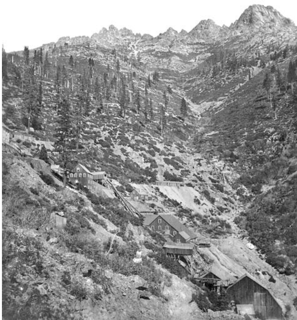
Hitchcock & Reis Mills, below the Sierra Buttes